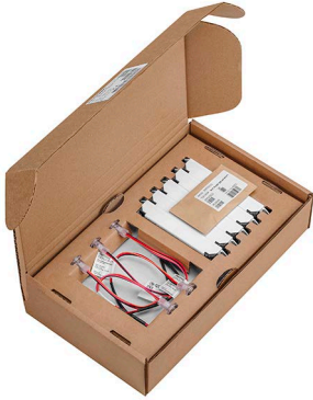
EM AP Lighthouse 18 mm