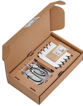
EM AP Lighthouse 36 mm