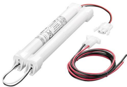
Stick + Stick