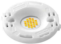
Housing with LES13