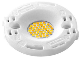
Housing with LES17