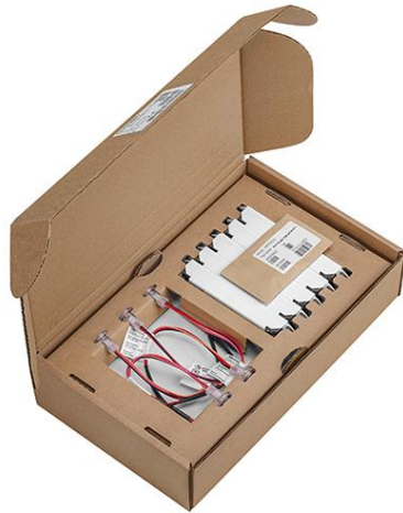
EM AP Lighthouse 18mm

Combined emergency lighting LED driver 1 – 4 W