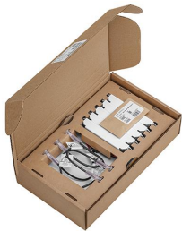
EM AP Lighthouse 36mm